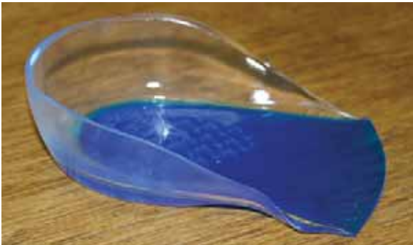
Gel heel cups

Examination of the area reveals local tenderness at the back of the heel, generally at the insertion of the tendo achilles. The tendo achilles is taut, so that dorsiflexion of the ankle is limited to a right angle or less. The patient will generally have pain when asked to walk on their heels and no pain when asked to walk on their toes. X-rays are usually normal.