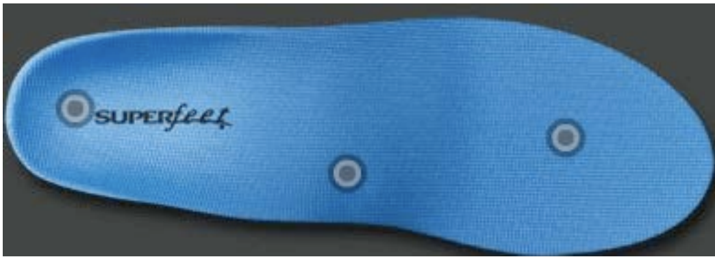
Superfeet BLUE Insole Available at Sports Chalet, Chick's, REI & Nordstrom

If a child has significant calf or foot pain, the doctor may suggest a lightweight tennis shoe that has a good arch support built into it. In many cases a formal insert or orthotic can be considered to make the child more comfortable.